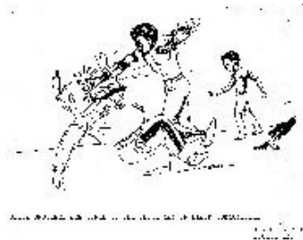
Click for full size picture. (12K)